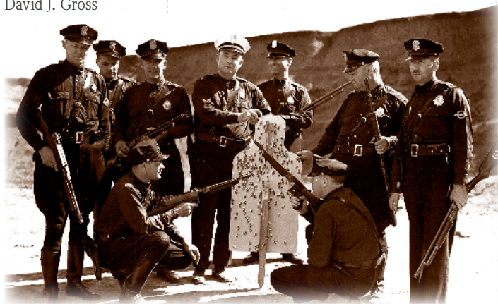
This 1940 photo from the Denver Public Library's collection of the Denver Police Department shows officers practicing urban shooting skills with Thompson machine guns and Model 1897 shotguns.