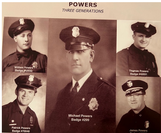
Three generations of Police Service