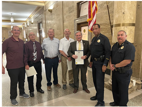
Powers Proclamation at City of Denver Municipal Building